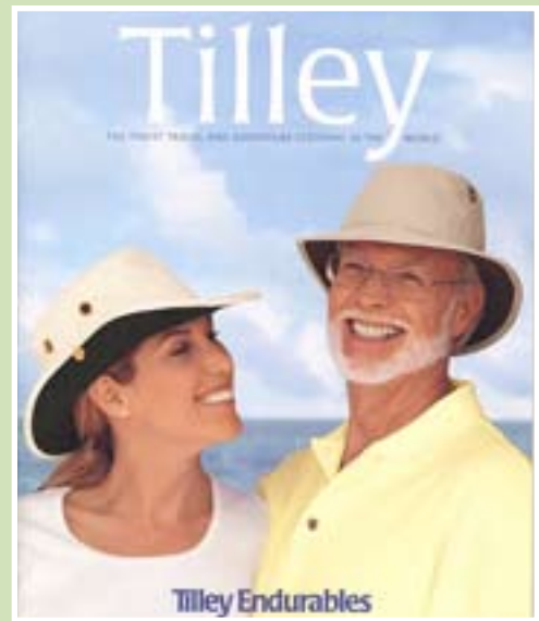
My Dad and I