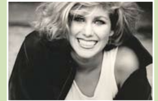
Me Modeling at Age 13

A highlight of the trip was when two huge bales of marijuana washed ashore on Day 2. We entertained ourselves in the evenings by throwing handfuls of pot on the open fire, leaning in and, yes, inhaling deeply. (Fortunately, the pot smoking was a teenage experience, not a lifestyle I continue today.) I wonder to this day what on earth happened to the chaperones during those evenings of indulgence. This was another adventure that fuelled my lifelong fascination with tropical islands.