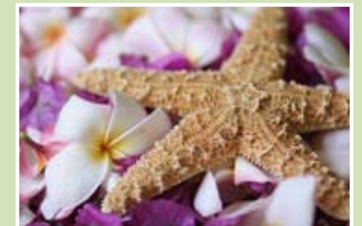
Starfish with Flowers