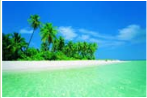
Searching for Islands