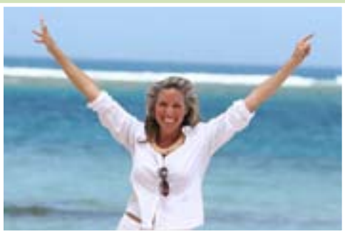
Changing Life's Direction