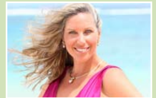
Welcome to Tropical Living