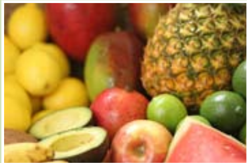
The Bounty of Nature