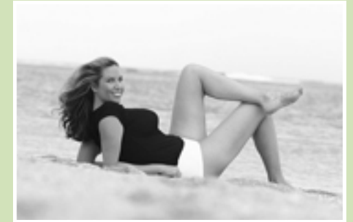
My Tropical Life

I headed off to the South Pacific Islands for the 5th time for some much-needed rest and rejuvenation. It was time to slow down, reflect and go within. I approached a village chief with Kava root in hand and asked for permission to be dropped off on a remote deserted island in the Vavau’a group in the Kingdom of Tonga for 4 days. I reconnected with myself, made talk tapes, wrote lists of how I wanted my life to be and started re-designing my life. I realize now, I was preparing for my next “mid-course correction”. I escaped the busyness of the life I had created and began to transform in the seclusion of the tropical environment.