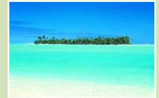
A Tropical Island