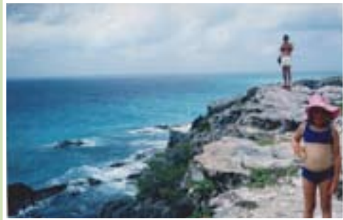
Me and My Dad Before Tilley Hats