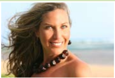
My True Essence