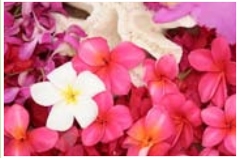
What I Love About Islands