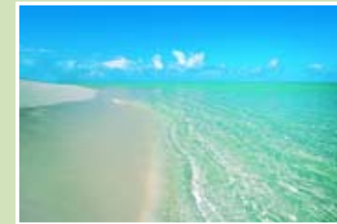
My Life's New Direction

At the age of 20, I had not seen my father for a couple of years and missed him deeply. Sir Edmund Hillary, the first man to summit Mt. Everest, invited my Dad and a small group of people to join him on a 10-day trek in The Kingdom of Nepal. For my 21st birthday, my father surprised me with a plane ticket to Nepal and an invitation to join them. It was on this trip that I was inspired to start another company designing and selling knitted sweaters and thick, colorful wool socks.