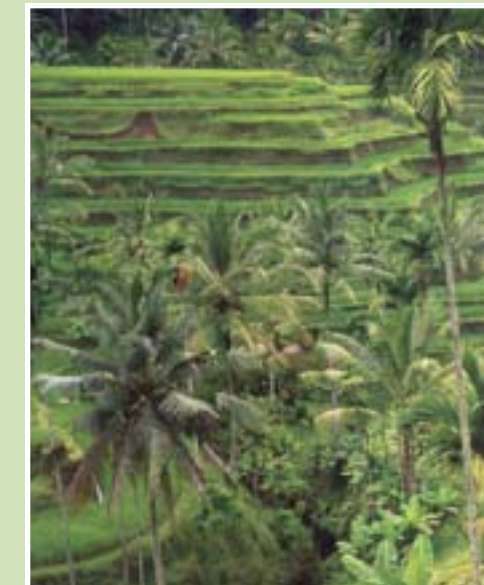
Moving to Bali