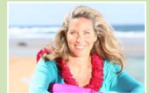
Looking at Time