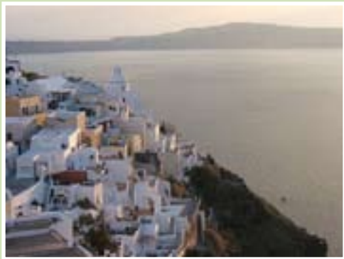
Islands in Greece