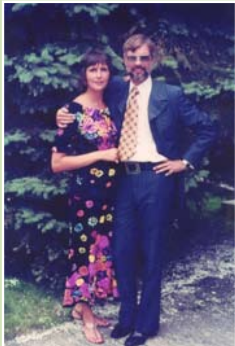
My Parents in the '70s