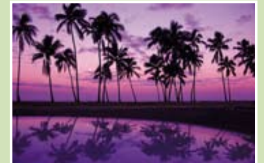
The Birth of Tropical Living